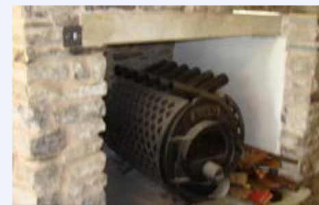
Fig 4 Wood-burning stove, housed within body of stone staircase (German 18kw design)

As this is a listed building, the repair process raised some additional challenges – however, the alterations made were carefully chosen to complement the style of the building and is an illustration of what can be done with ingenuity!