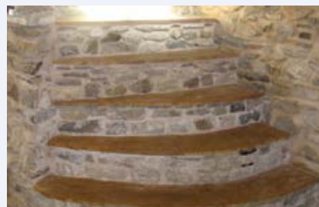
Fig 3 - Resilient (and very attractive) steps to upstairs flat (replaced standard wooden staircase)