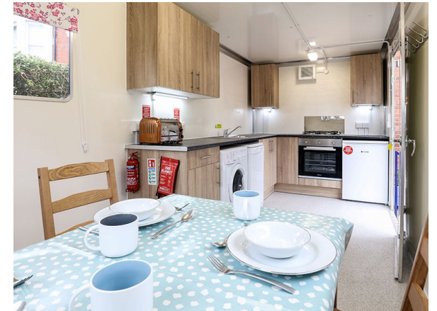
Examples of at-home solutions including kitchens and bathrooms from Temporary Solutions Group