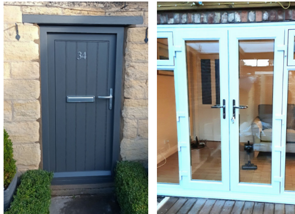
Hardwood Heritage flood door and French doors

If a customer's home is flooded, and they meet our criteria for the 'Build Back Better' scheme – as outlined below – we'll offer them up to £5,000 towards the installation of flood resilience measures and help our customers take a proactive approach to the issue. Find out more: www.ageas.co.uk/build-back-better/